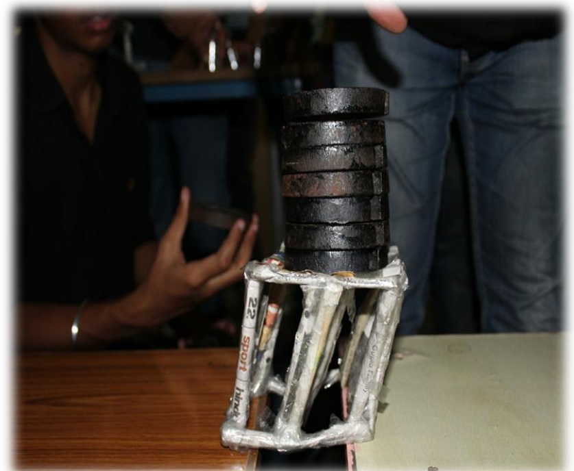
1 ST PRICE WINNER BOB THE BUILDER

Later on price distribution was held and prices were given to the students by the honorable Principle Sir and respected HOD.